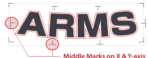
Middle Marks on X & Y-axis

Segment Area Compensation (X-Y) Recognizes middle marks between the registration marks to correct X / Y-axis distortion for greater accuracy when cutting longer length media.