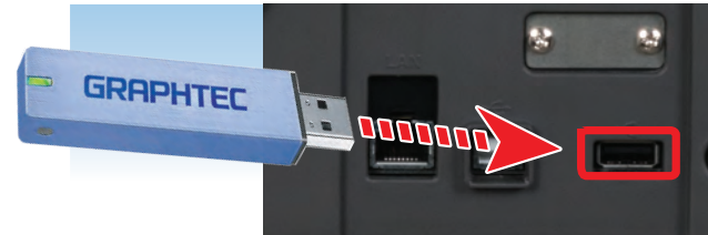
USB Offline Operation