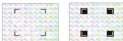
Reversed Color Registration Marks