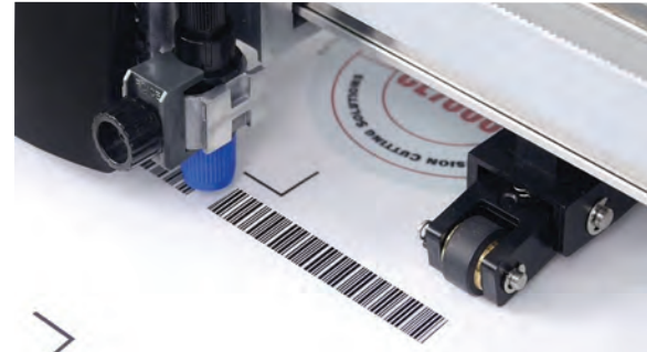
Barcode Scanning System

Auto Paneling automatically splits long-length jobs into smaller pages that are cut sequentially to prevent skewing.