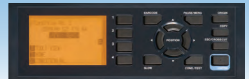
Intuitive 3.7" LCD Control Panel