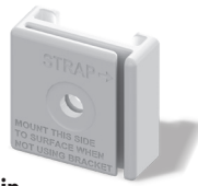
Clip 402106-20 Each carton of SignBOX 3 comes with 40 clips