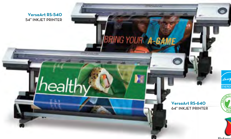
VersaArt RS-640 64" INKJET PRINTER