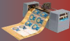
Gerber GS Series Plotters