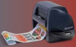
GERBER EDGE Series Thermal Transfer Printers