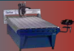
Gerber Sabre® Routers