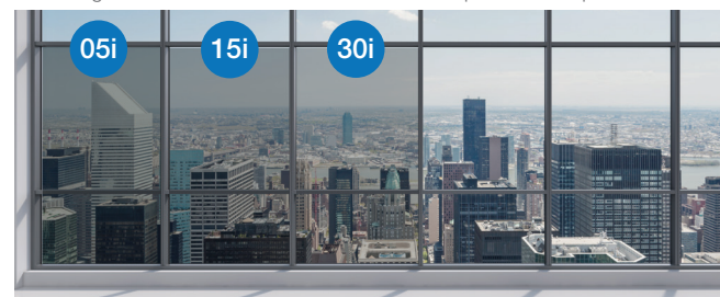
NT Natura 05i | NT Natura 15i | NT Natura 30i

This image has been simulated and is not actual product comparison