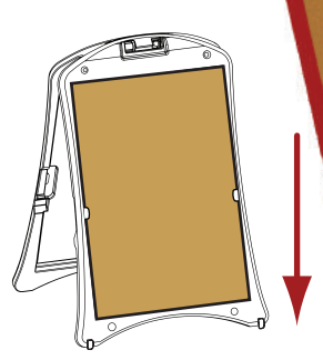
4. Slide sign down into bottom slot