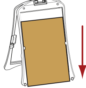
2. Slide through, pulling sign in front of bottom slot until sign hits the ground