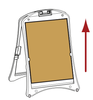
3. Push sign up into top slot