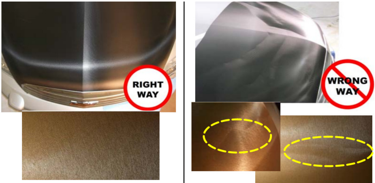
Figure 1. Proper techniques ensure a professional looking wrap (Carbon fiber shown on top, Brushed Metal on bottom)