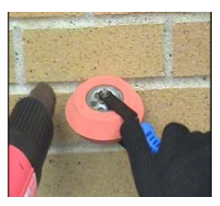
Using TSA-2 to work film into mortar joints