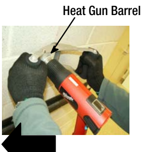
Direction of Movement for this tool orientation