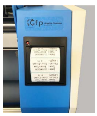
ROLL LABEL PRINTER generates pressure sensitive label with film description and remaining footage for labeling partial film rolls.