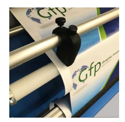
INLINE ROTARY SLITTERS trim the sides of output during lamination to save time and increase productivity.