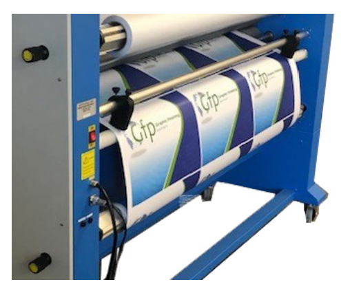
INTEGRATED REAR REWIND is motorized for longer, uninterrupted roll-to-roll operation.

Along with its rugged design and many built-in labor-saving features, the 663TH's electric servo motor and positioning encoder deliver precise control of roller gap position and nip pressure. A host of production class features like integrate rear rewind, inline slitting, and swing-out shafts provide the reliable performance the finishing professionals need to ensure the highest quality output and maximum productivity.