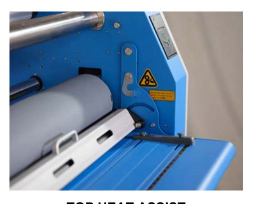
TOP HEAT ASSIST softens film adhesive to reduce silvering for better quality output and to shorten processing time.