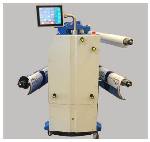
THREE SWING-OUT SHAFTS save time loading and unloading rolls for faster setup and change-over.