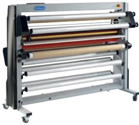
Rear and front views