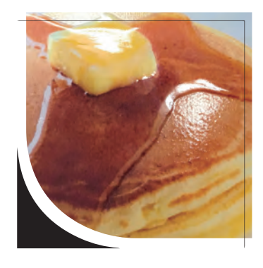
GLOSSY & MATTE VARNISH

The XpertJet 461UF, compact UV-LED flatbed printer offers many features including a larger printable surface area, a larger window for safe viewing, an updated touchscreen panel, an improved LED lamp, optional vacuum table providing the ability for increased printing depth and more. The XPJ-461UF is powered by MUTOH's new genuine VerteLith™ RIP software, bundled with FlexiDESIGNER MUTOH Edition 21, a $2,199.00 value. VerteLith RIP optimizes all of the capabilities of the XPJ-461UF, increasing productivity and profitability. The XPJ-461UF allows for finer texture layers which instantly adds value to any print. Tie that in with MUTOH's Local Dimming Control Technology, you now have the ability to add high glossy finishes easily in one pass.