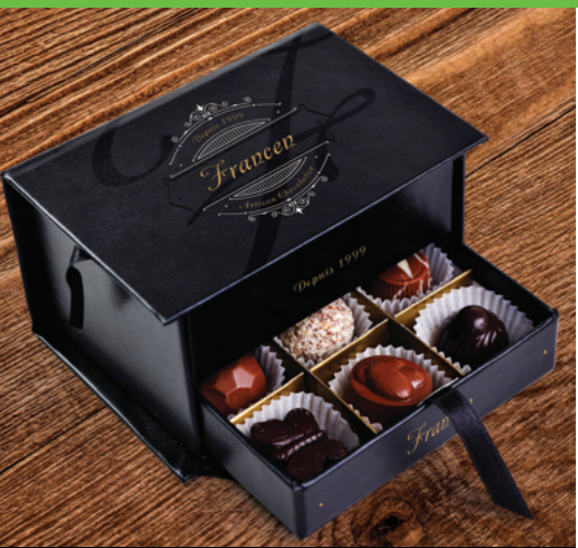
Compatible with a world of flexible media, bring your unique packaging vision to life with realistic proofs and prototypes.