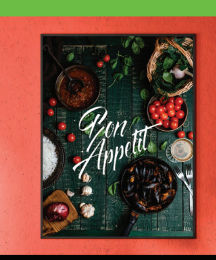
Customize panels, sheets, canvas, display boards and so much more with the ease, speed, and simplicity of direct-to-object printing.