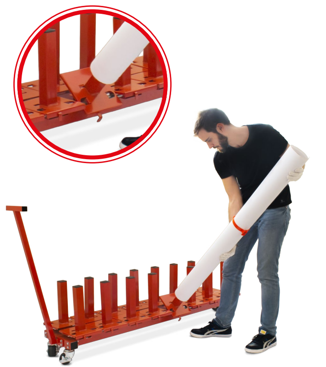
REF : PHTIBMA